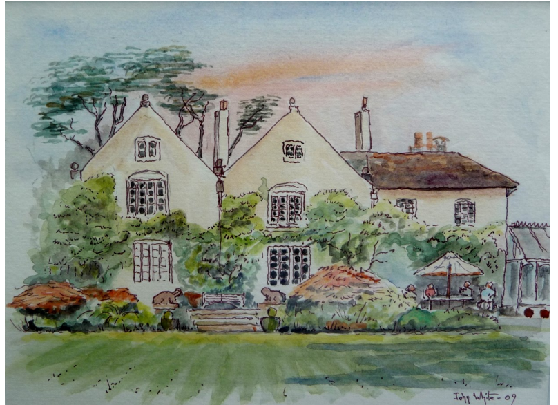
John’s watercolour of West Burton House