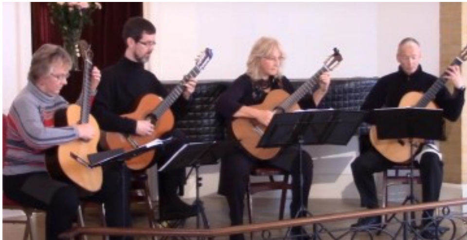
The New Gala Guitar Quartet