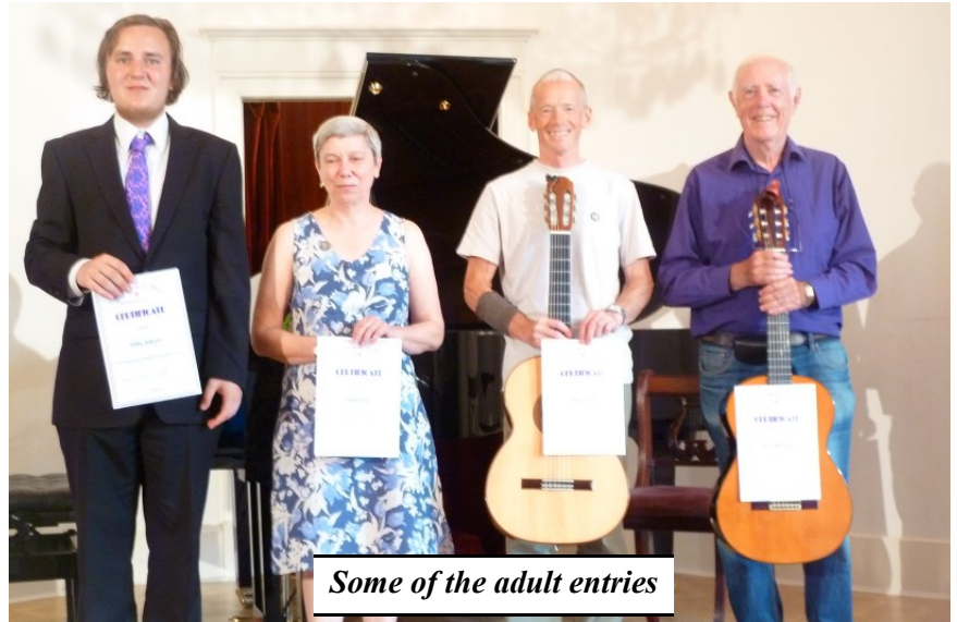
Some of the adult entries