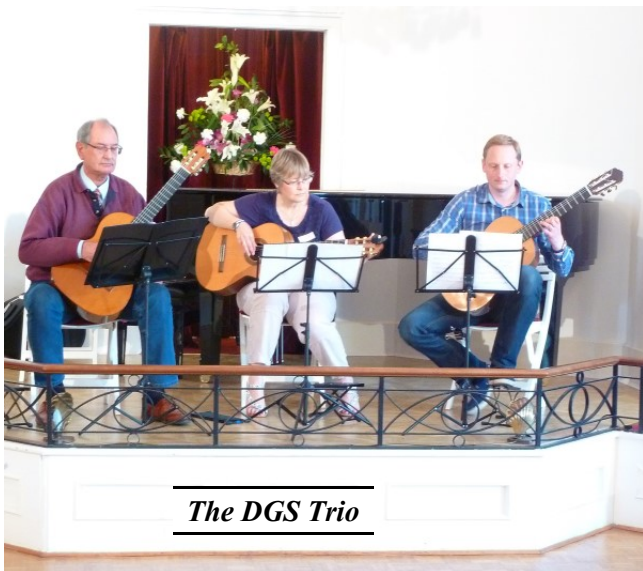
The DGS Trio