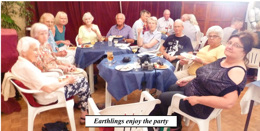
Earthlings enjoy the party