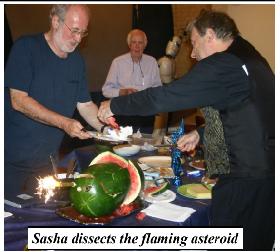
Sasha dissects the flaming asteroid