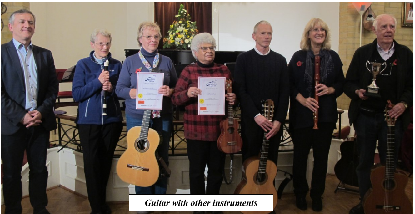
Guitar with other instruments