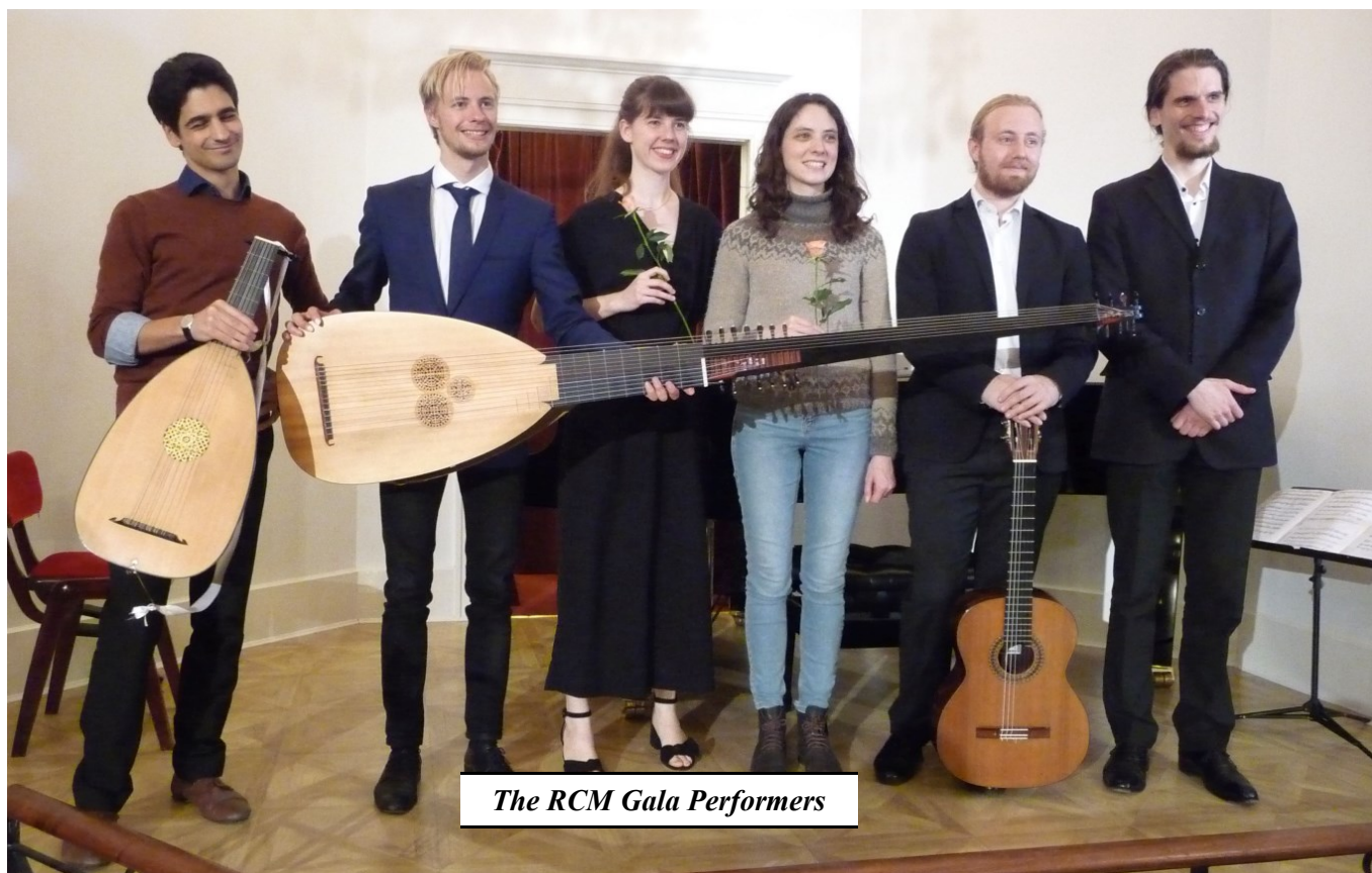
The RCM Gala Performers