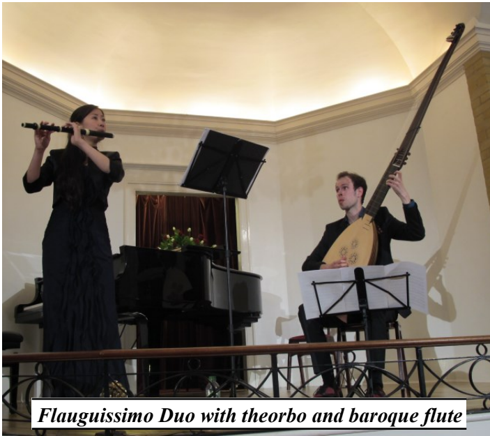
Flauguissimo Duo with theorbo and baroque flute