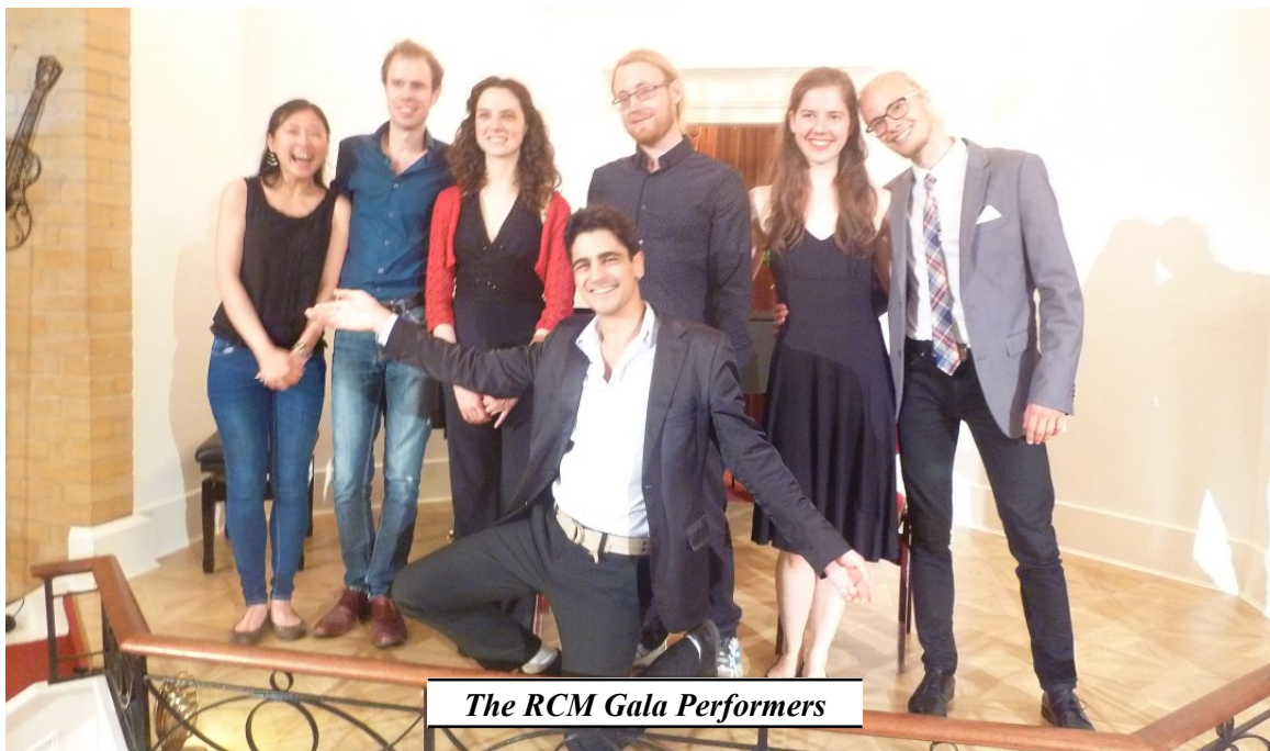
The RCM Gala Performers