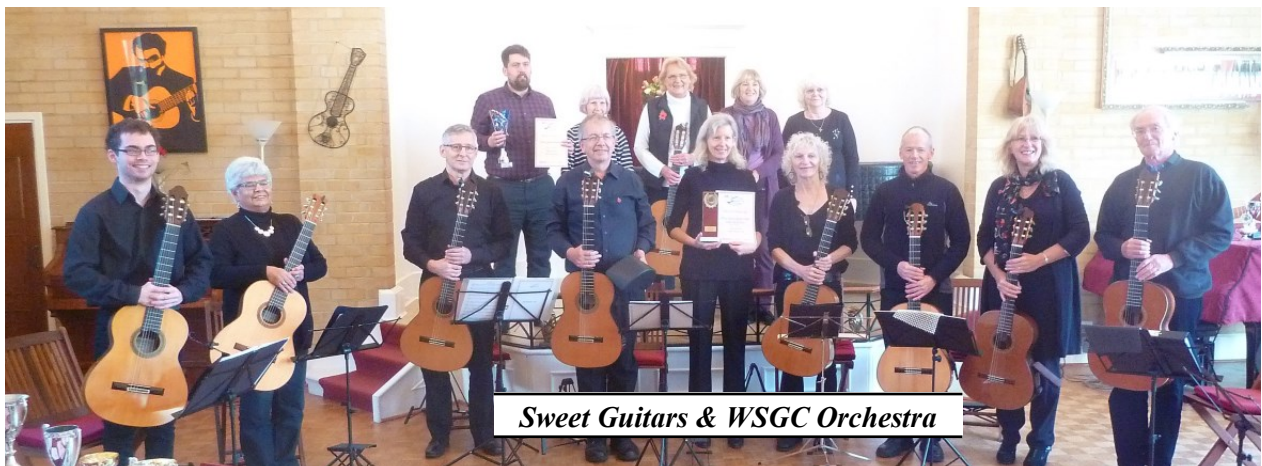
Sweet Guitars & WSGC Orchestra