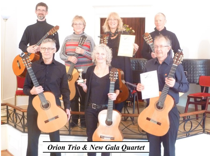
Orion Trio & New Gala Quartet