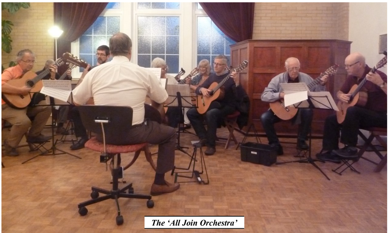
The 'All Join Orchestra'