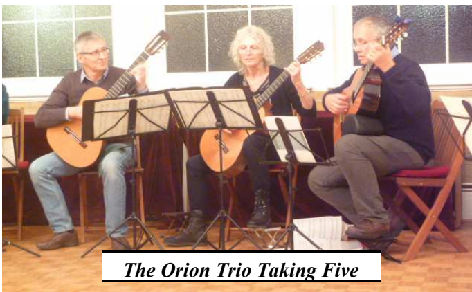
The Orion Trio Taking Five