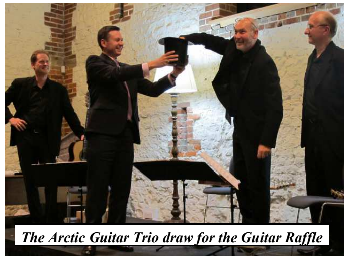
The Arctic Guitar Trio draw for the Guitar Raffle