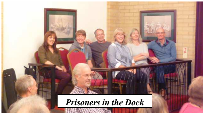
Prisoners in the Dock