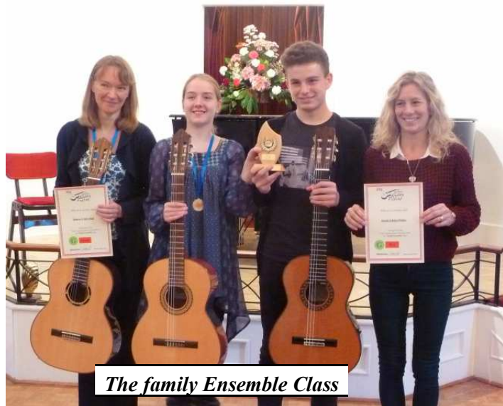
The family Ensemble Class