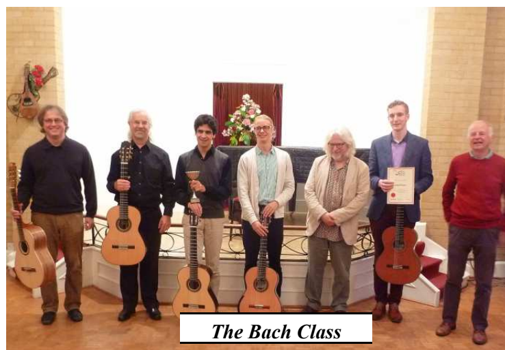
The Bach Class