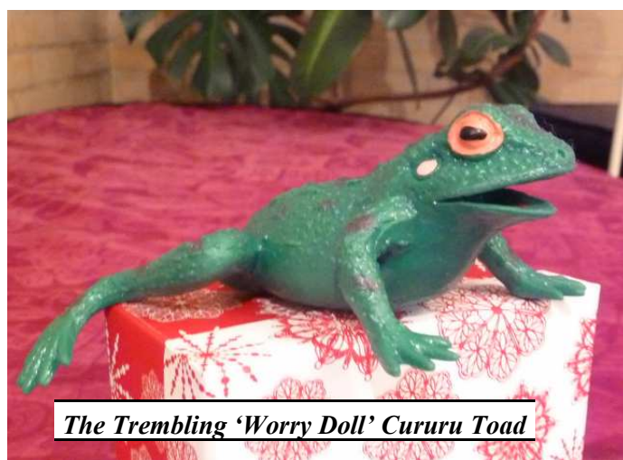
The Trembling 'Worry Doll' Cururu Toad