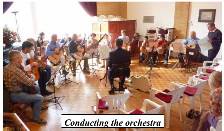
Conducting the orchestra