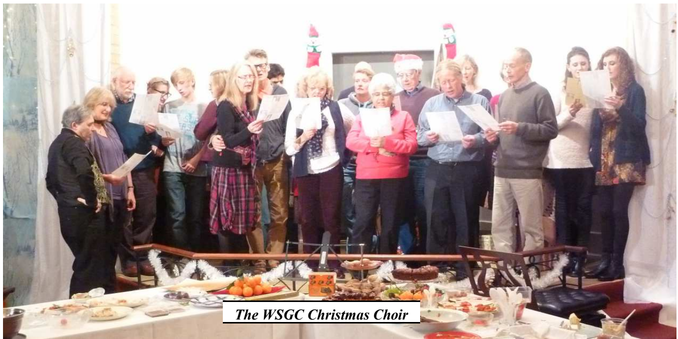
The WSGC Christmas Choir