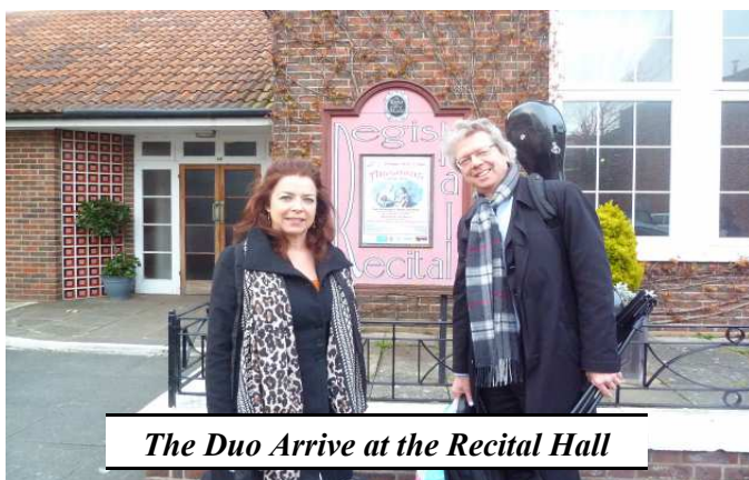
The Duo Arrive at the Recital Hall