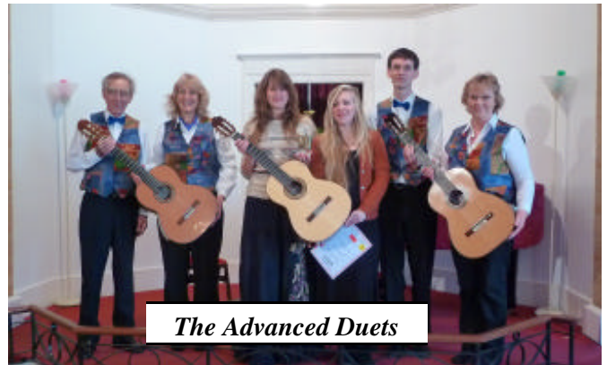
The Advanced Duets