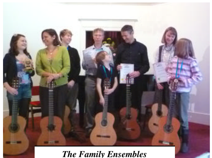
The Family Ensembles