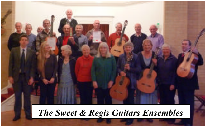
The Sweet & Regis Guitars Ensembles