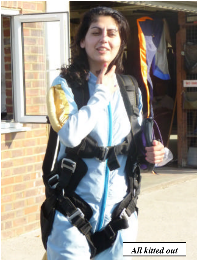
All kitted out