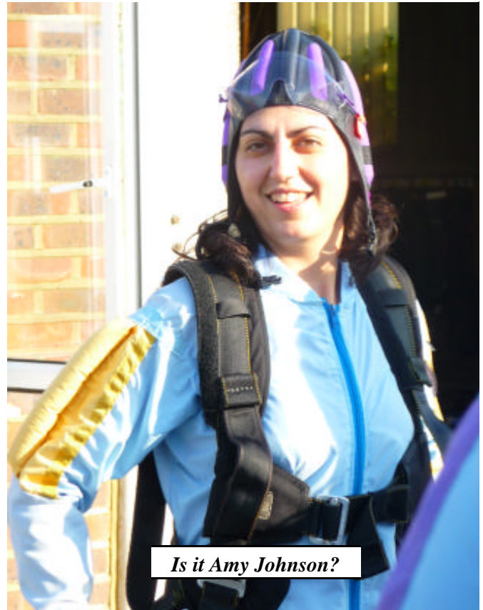
Is it Amy Johnson?