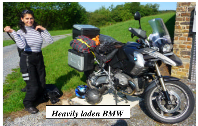
Heavily laden BMW