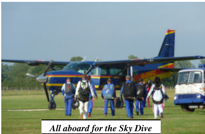
All aboard for the Sky Dive