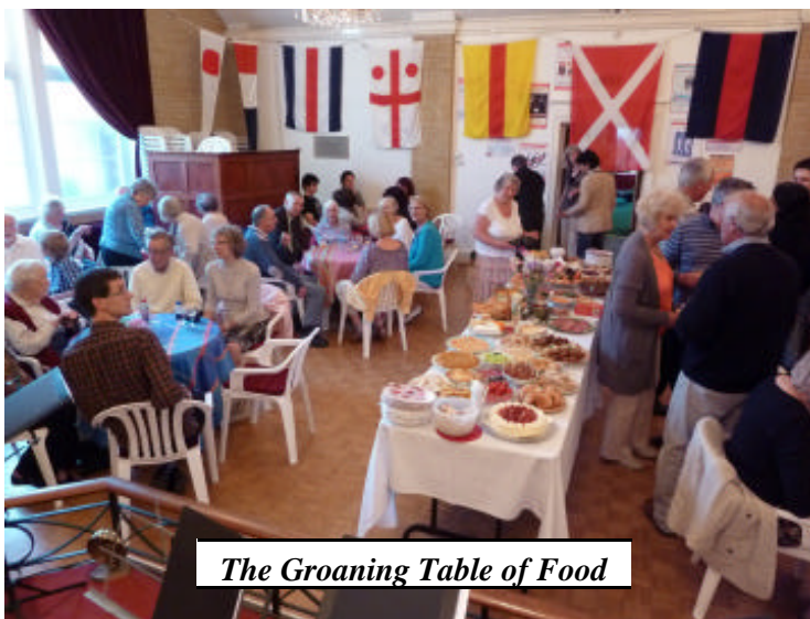
The Groaning Table of Food