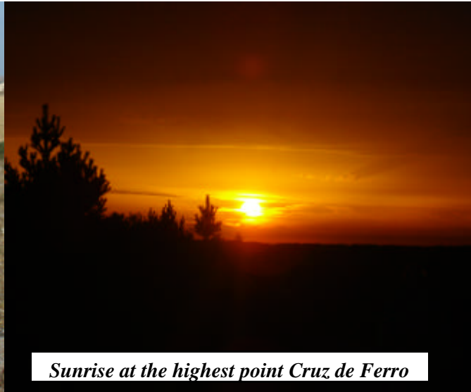
Sunrise at the highest point Cruz de Ferro