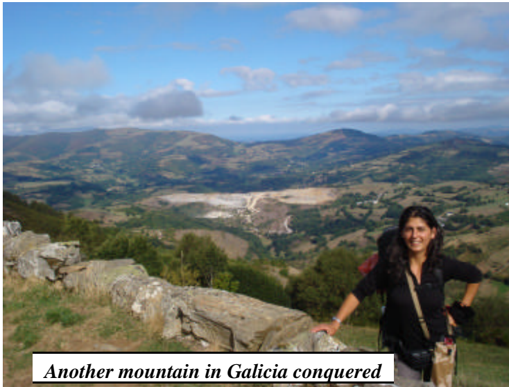
Another mountain in Galicia conquered