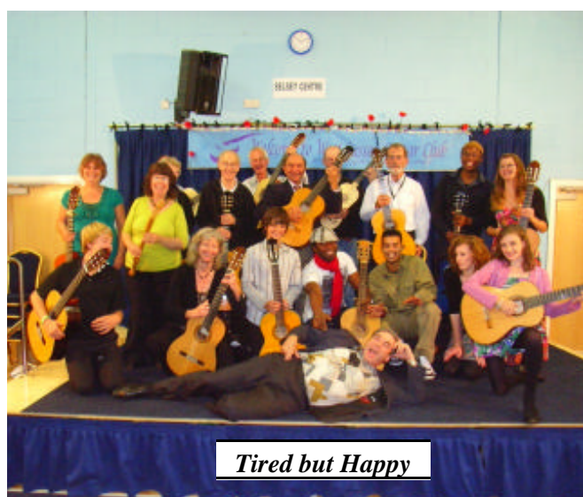
Tired but Happy