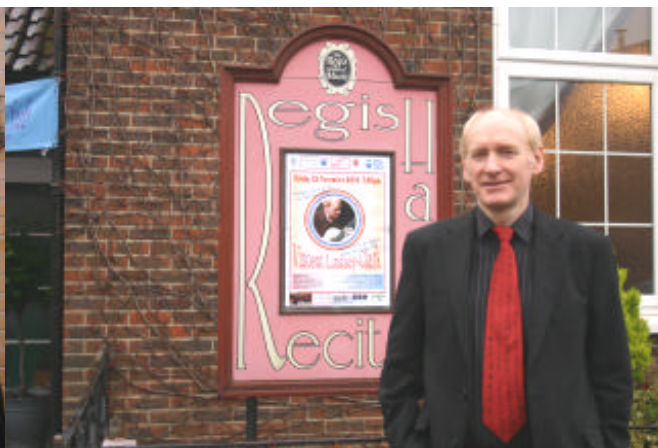
Outside the School