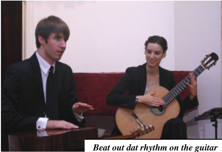
Beat out dat rhythm on the guitar