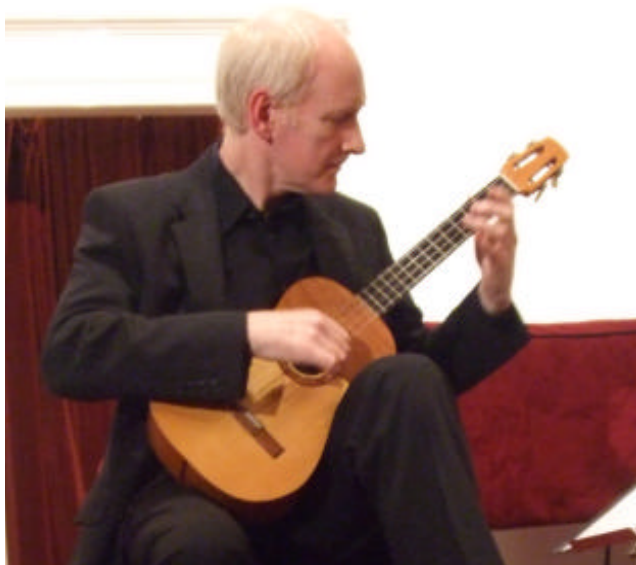
The Venezuelan Cuatro