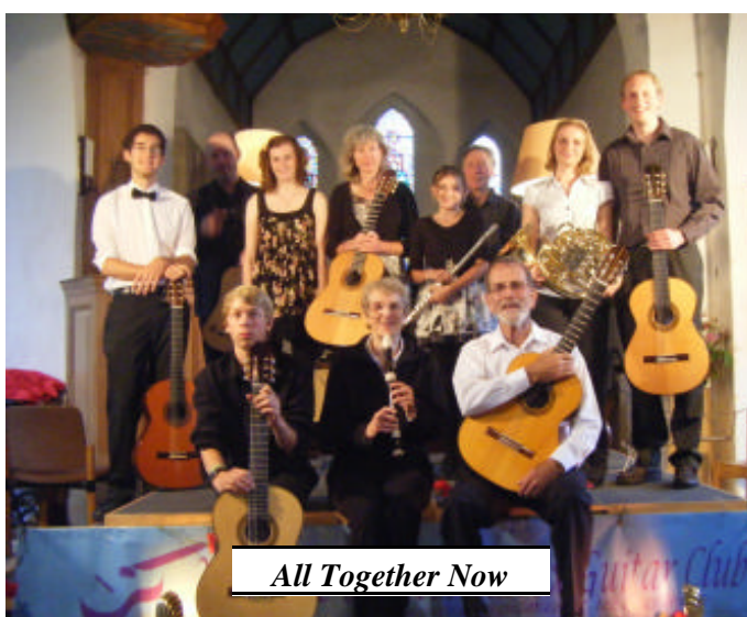
All Together Now