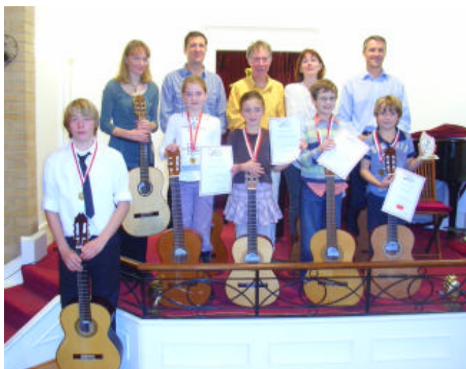
The Family Class