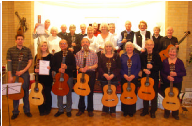
Senior Regis Orchestras