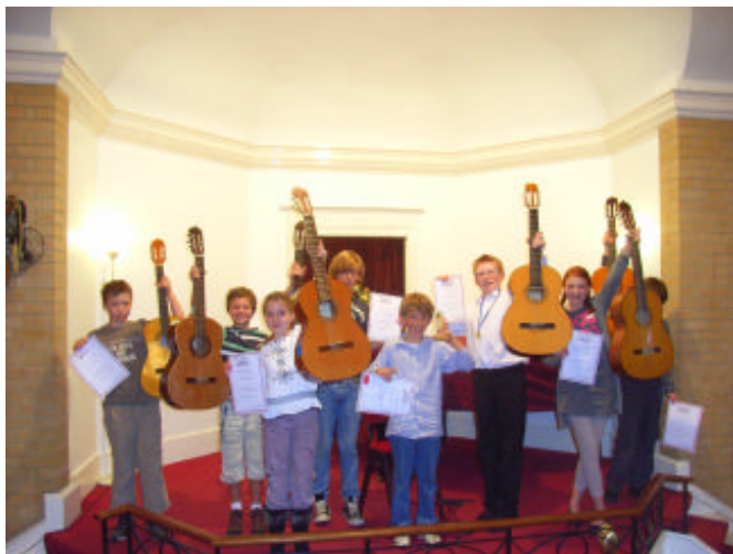
Solo Class under 12 years old