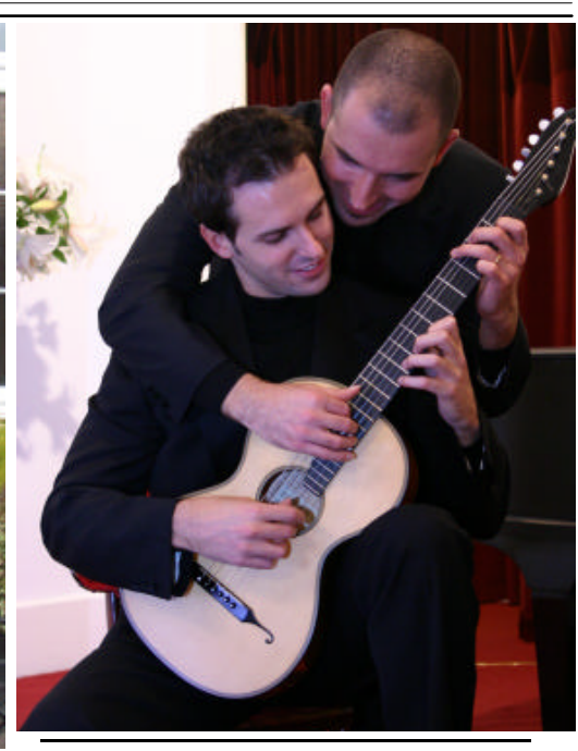
As the credit crunch bites, the duo have to share a guitar