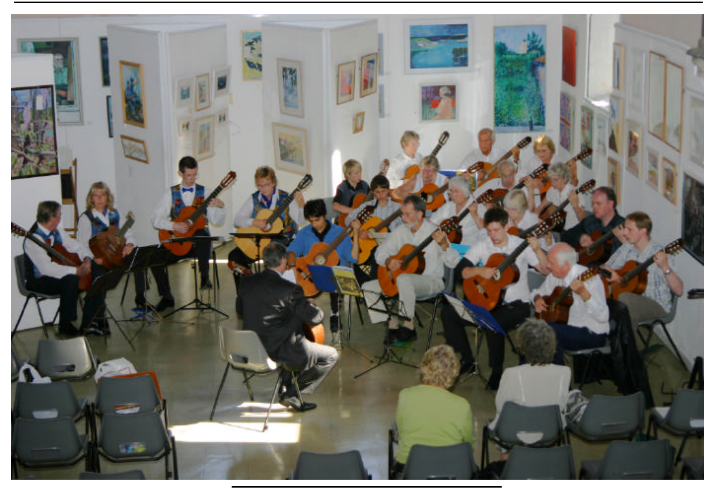
Regis Guitar Ensemble begins the concert