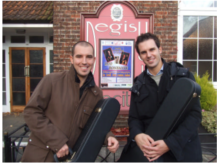
The Duo arrive