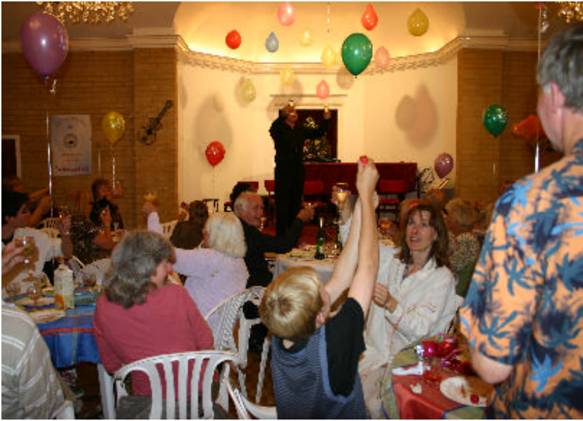
The toast with party poppers