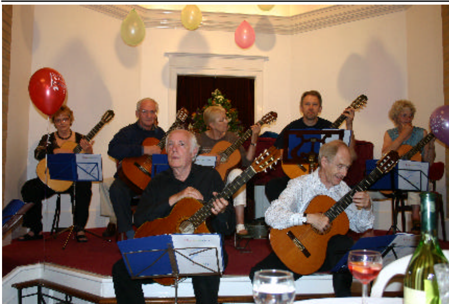
The Regis Guitar Orchestra begin our travels to Distant Lands