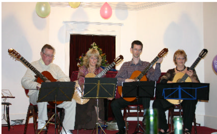
The Gala Quartet visit a Persian Market