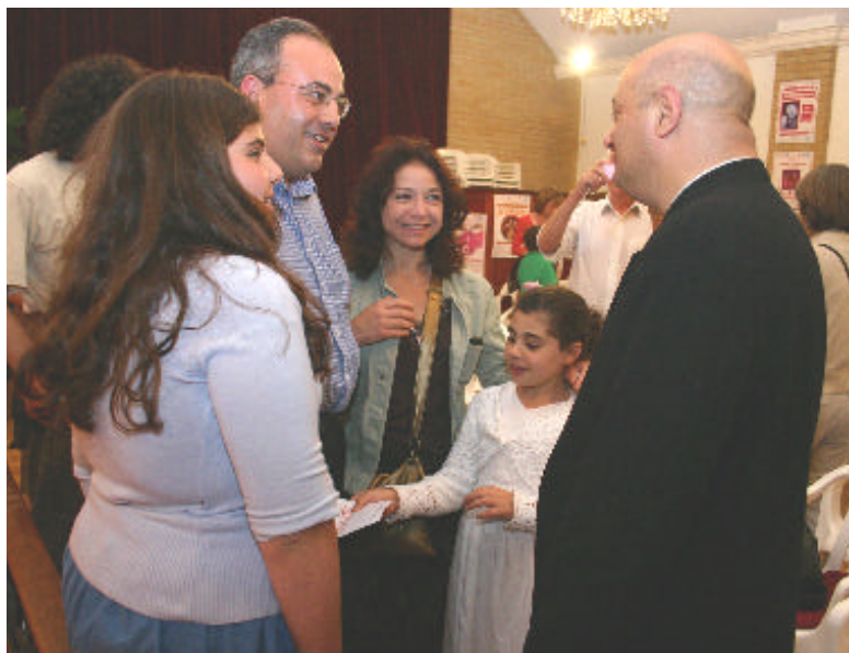
Charles meets the Caruanas