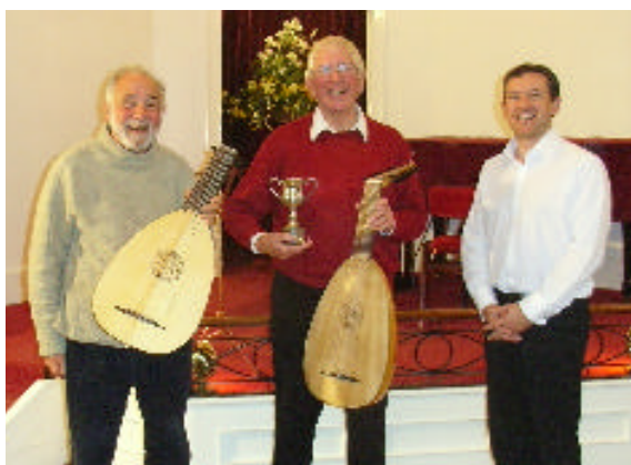
The Arbeau Lute Duo