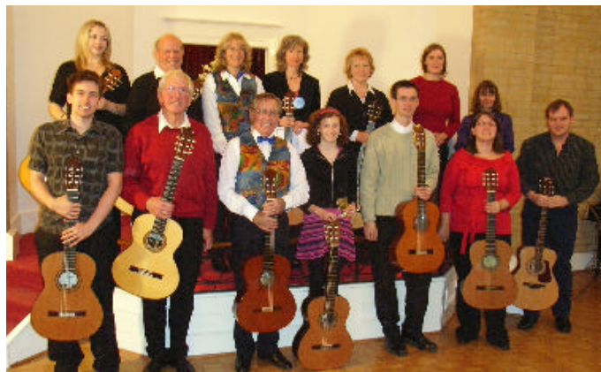
The Guitar Duet Class