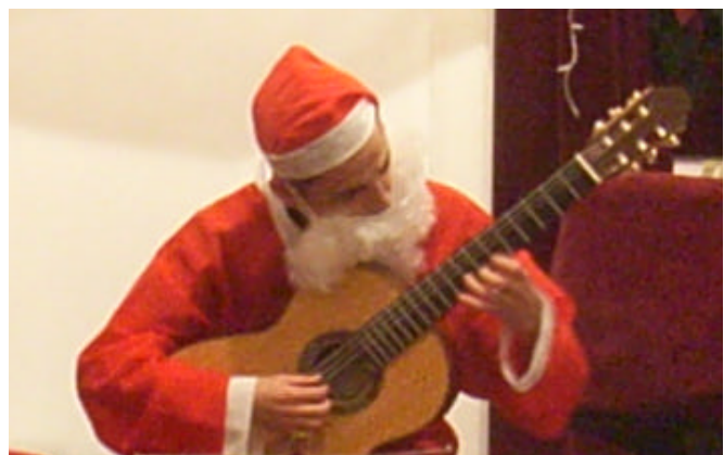
Father Christmas Plays Guitar