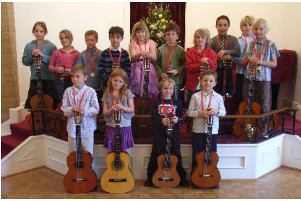
Initial Class Age 9 & Under