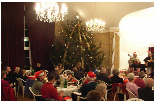
The huge Christmas Tree with Party Revellers