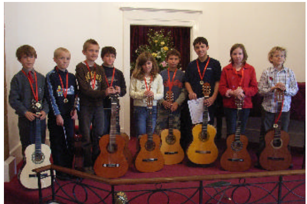
Initial Class Age 10 -12