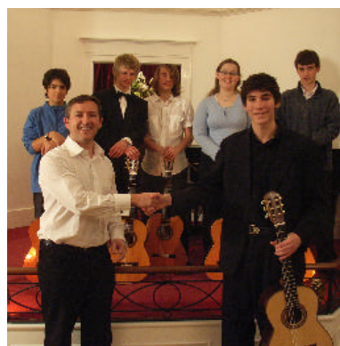
The West Dean Class