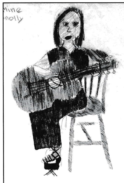
by Jasmine Conolly (age 9)

We're delighted to include these contributions from our younger friends - please keep them coming!