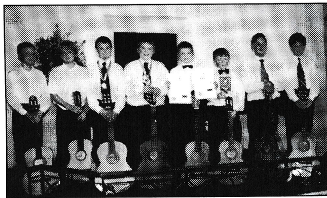
Guitar Duet Class