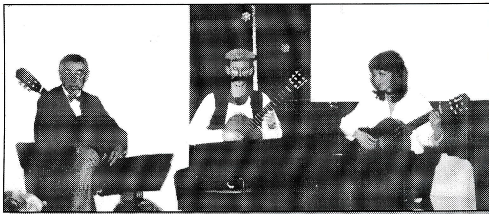
The Gala Trio - and that moustache!