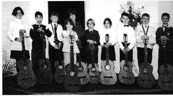
Class 651: Solo. Novice 9 & over