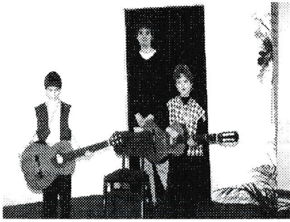
Class 650 : Solo Novice