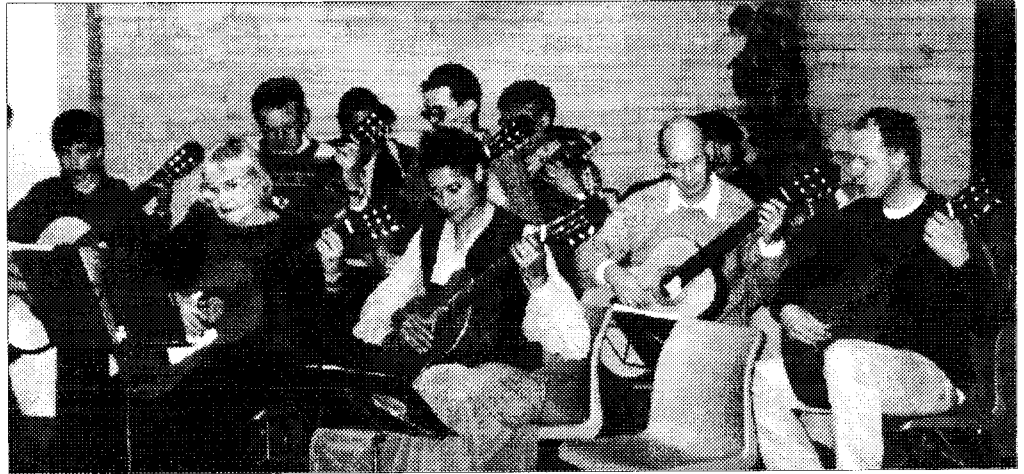
Engrossed in Handel

In a short space of time the orchestra achieved a really nice tone and unity, and judging by peoples' comments everyone enjoyed some invaluable sight-reading practice.