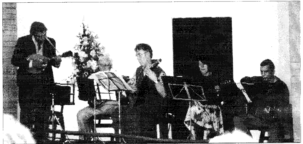
Our new friends from Brighton blending the guitar with its younger sister, the mandolin to good effect