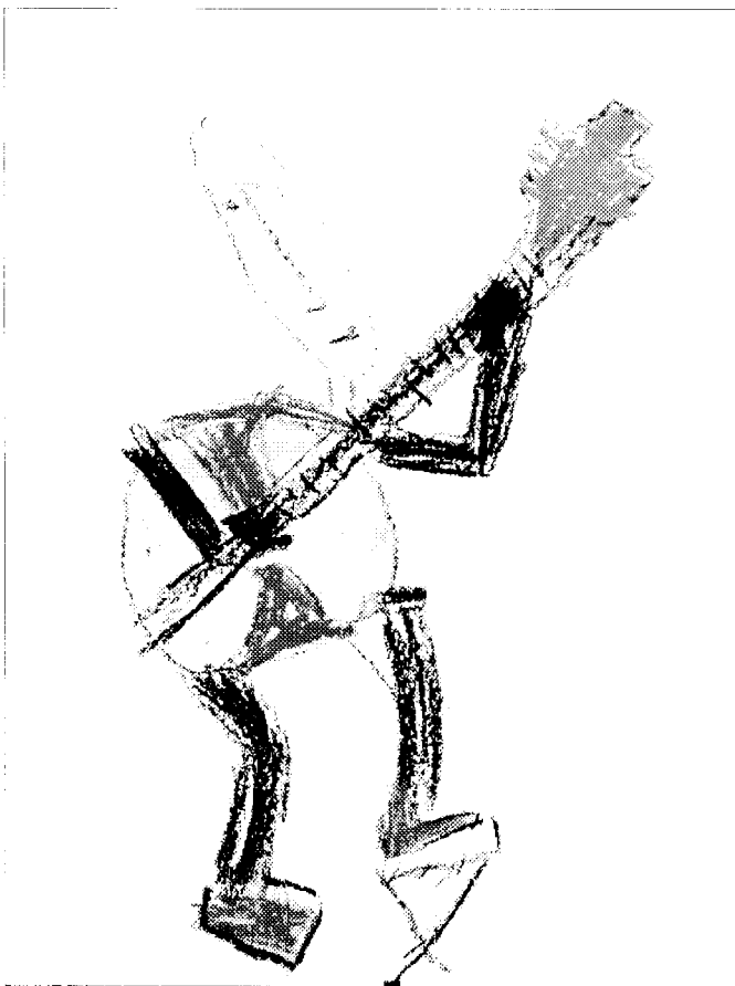
"Man with Guitar"